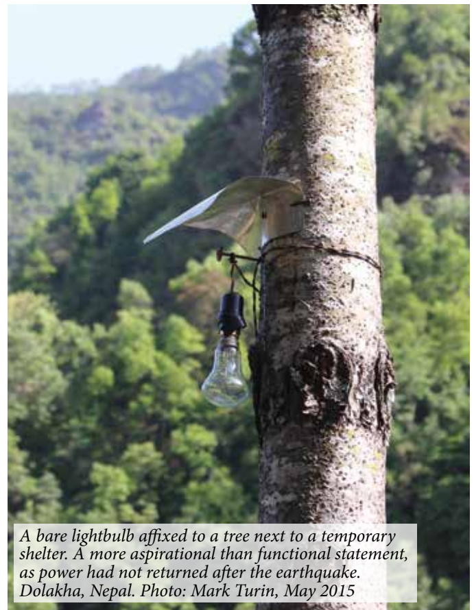
A bare lightbulb affixed to a tree next to a temporary shelter. A more aspirational than functional statement, as power had not returned after the earthquake. Dolakha, Nepal.