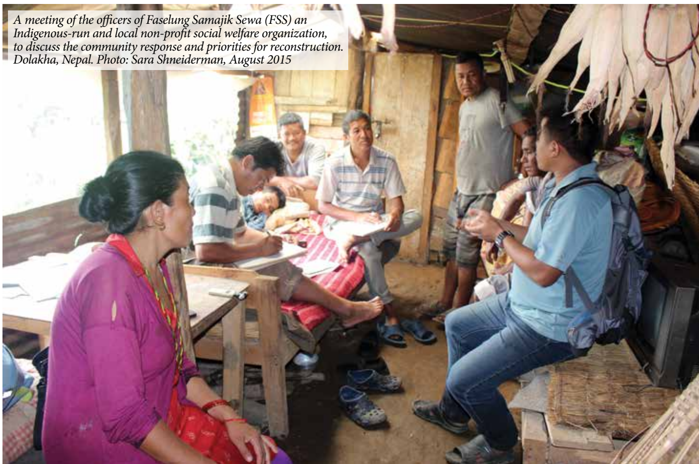
A meeting of the officers of Faselung Samajik Sewa (FSS) an Indigenous-run and local non-profit social welfare organization, to discuss the community response and priorities for reconstruction. Dolakha, Nepal.

The community was waiting. They would be watching the heavy rains of the monsoon that typically would last into October to see whether the local landscape and topography would be reshaped once again after landslides and floods. As individuals, families, households, and as a community, they were making careful decisions, informed by detailed local and traditional environmental knowledge, to wait out the rains and decide where to rebuild their lives only once the skies have dried.