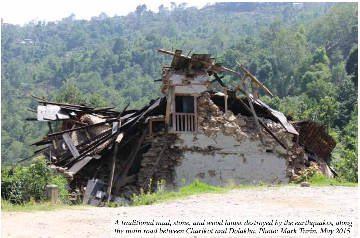
A traditional mud, stone, and wood house destroyed by the earthquakes, along the main road between Charikot and Dolakha.

The loss to lives and livelihoods brought about by the earthquakes that ravaged Nepal in April and May 2015 has been immense, but the full impact—what we may refer to as the political, social, economic and emotional aftershocks—is only now beginning to be understood. Here we ask: how has the Thangmi community, one of Nepal's Indigenous and historically marginalized groups, been affected and impacted by this natural disaster? How have the Thangmi responded and begun to rebuild their lives? How has the earthquake challenged traditional understandings of land, territory, family and the environment?