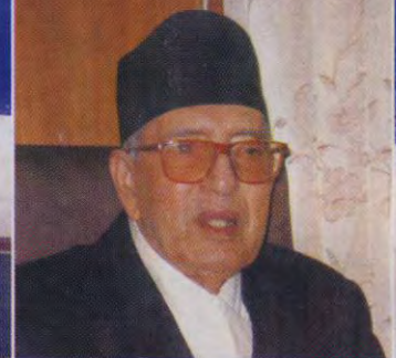
PM Girija Prasad Koirala

NEPAL STOCK EXCHANGE LIMITED TODAY'S INDEX & TRADING PRICE